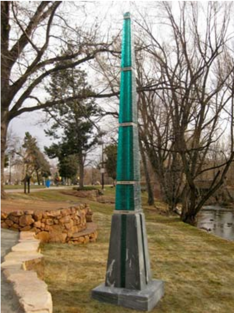
Gilbert F. White Memorial. Boulder Creek, Boulder, Colorado.