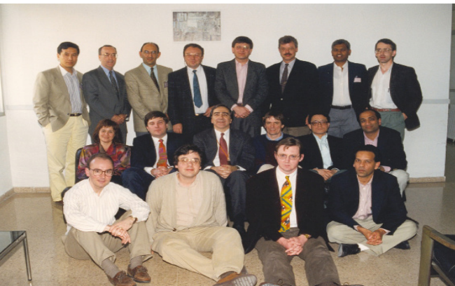
Gathering with former students, circa 1985.