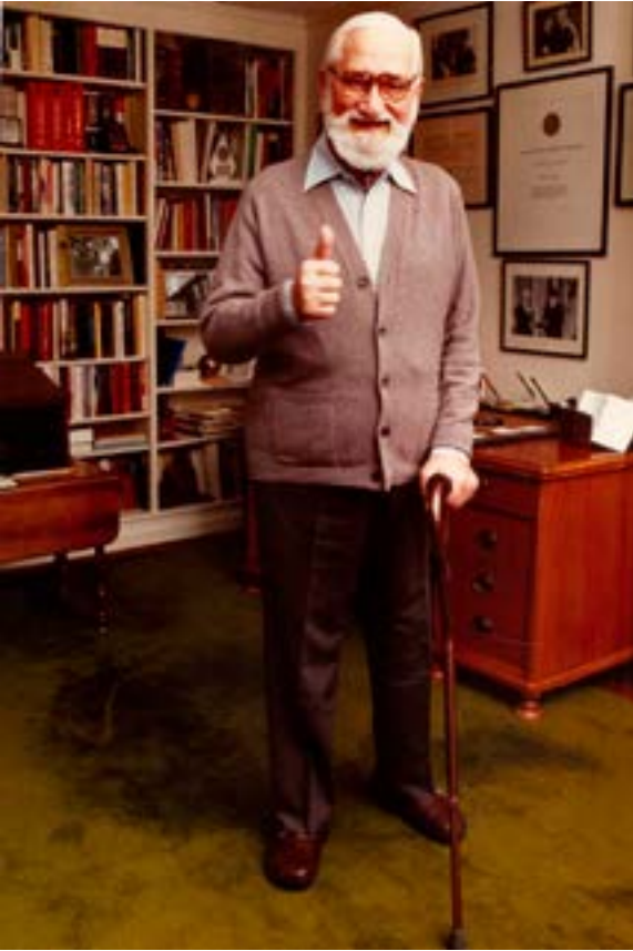
Sabin in his home still walking with a cane after his illness in 1983.