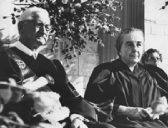
Sabin with Israeli Prime Minister Golda Meir at Weizmann Institute, 1971.

They [the Israelis] were creating a culture and a life [that] really had a tremendous emotional impact on me....Although my whole cultural pattern was that of an American, I could not divorce myself from this association of what I would call 4,000 years of heritage....After this trip I became even more strongly influenced by the events [in] Israel than I ever was before...I wanted to help in whichever way I could.