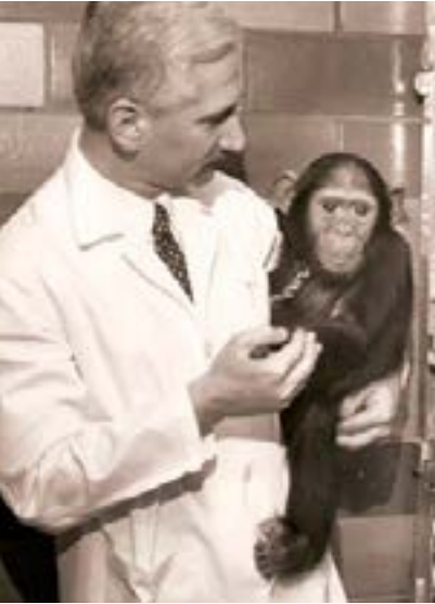
Sabin in his laboratory in Cincinnati where he used monkeys to conduct his poliovirus research.

poliovirus was transmitted through the alimentary tract and was rarely found in the nasal passage (as giants in the field, such as Dr. Simon Flexner, had previously argued). This breakthrough in 1941 paved the way for subsequent research and ultimately helped provide the basis for the orally ingested polio vaccine.