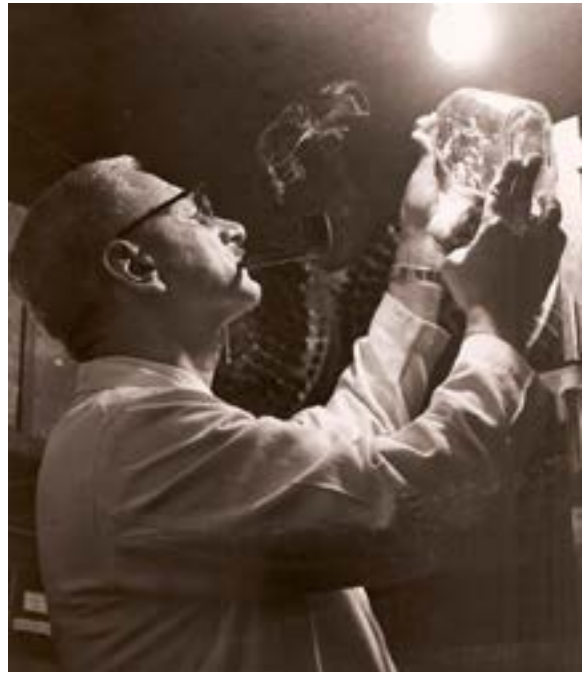
Sabin in his laboratory in Cincinnati, 1950s.