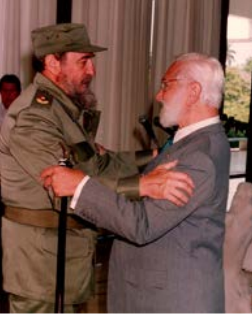
Sabin with Fidel Castro in Cuba to receive the Carlos Finlay Order, Cuba's highest honor awarded to a scientist, 1987.

man," he explained in his speech upon receiving the Rotary Award for World Understanding in 1985: