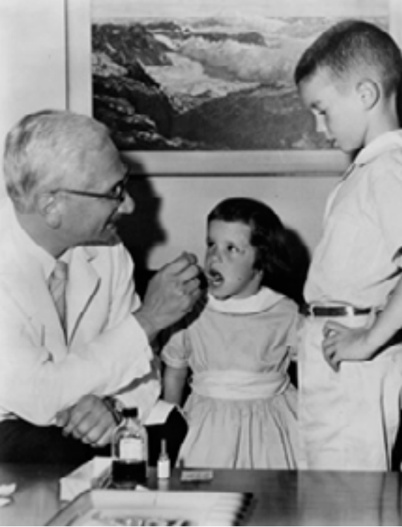
Sabin giving the OPV to children, 1959.

What Sabin was referring to in his letter to Rivers was the widespread speculation at the time that his proposed administrative strategy—involving mass-immunization campaign—was only viable in communist societies or within “socialist” public health systems. The countries that made the most dramatic progress combating polio during this period using Sabin’s vaccine were in fact communist, with the Soviet Union leading