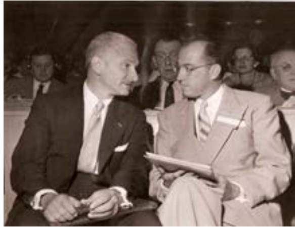
Sabin and Jonas Salk, at Third International Congress on Poliomyelitis, in Rome, Italy, 1954.

Twenty years later Sabin remained irked by the whole debate and the ways in which he and his position on the matter were commonly misrepresented. Contrary to the accusations made (both ca. 1955 and in subsequent retellings of the history), Sabin insisted that he had not opposed the use of a safe killed vaccine in 1955. Sabin was explicit that his primary objection concerned the strain of killed virus (the Mahoney strain) used in the Salk vaccine, which Sabin (and others) argued was more virulent than needed and could have severe consequences, as the disastrous Cutter incident in the spring of 1955 had demonstrated.