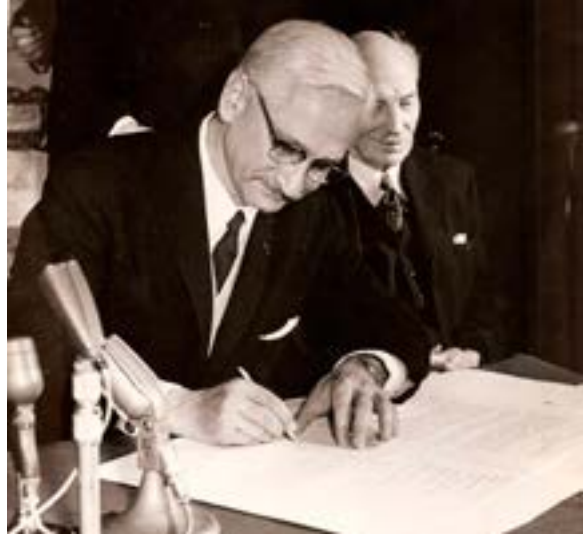
Sabin with Lord Attlee signing the United Nations Manifesto of the Conquest of Hunger. Rome, Italy, 1963.

Sabin’s activism increased throughout the 1960s as the Cold War persisted and active conflicts such as the war in Vietnam escalated. In fall 1965, he joined a group of prominent antiwar activists to organize and sponsor a “march on Washington for peace in Vietnam,” held on November 27. The following year, in December 1966, he collaborated with a group of prominent physicians, scientists, clergy, and intellectuals to establish the Committee of Responsibility (COR) to Save War-Burned and War-Injured Vietnamese Children. This committee, and Sabin’s advocacy in particular, helped convince U.S. policy makers to increase medical aid to South Vietnam. 28 The associated announcement, made by the Johnson Administration in April 1967, came only one day after Sabin was featured in a full-page advertisement in the New York Times making the COR’s case and calling on the American government to emulate the “basic humanitarianism of the American people.” 29