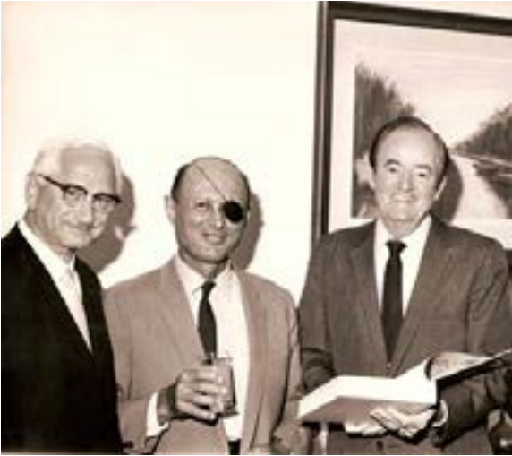
Sabin, with Hubert Humphrey and Moshe Dayan, at Sabin's inauguration as President of the Weizmann Institute, 1970.

Sabin was also extremely active in working to advance the cause of peace in the Middle East. In the aftermath of the Six-Day War in June 1967, he joined a group of prominent scientists, academics, and intellectuals to establish American Professors for Peace in the Middle East. Sabin served as the group's national chairman starting in October 1967, and in this leadership role he traveled frequently to Israel and a range of Arab nations, meeting with diverse leaders in an effort to generate support for high-level peace talks between Israel and its Arab neighbors.