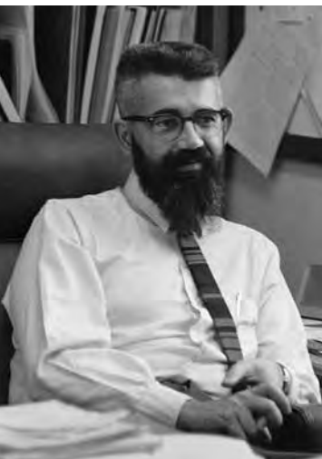
McCarthy in December 1965.

arrived at Princeton in September of 1949, the [Mathematics] Department Chairman, Solomon Lefschetz, said to me, "What are you going to do your thesis on?" and I said, "I don't know. I'll think about it." And so I immediately got myself a notebook, and started thinking about ideas for a thesis. Before the year was up, I had decided on a topic, and this made me relatively popular, because the usual thing is that the students pester the professors to suggest topics.