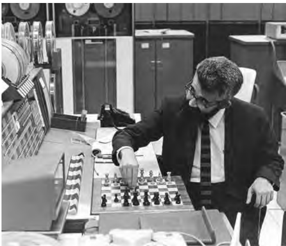
McCarthy in 1966, playing chess against a computer.

McCarthy also continued to develop the chess program he had worked on at MIT, and in 1965 he challenged a group at the Moscow Institute for Theoretical and Experimental Physics to a match with their own program. Moves were exchanged by telegraph. Neither program did very well, but the Russian program won the match.