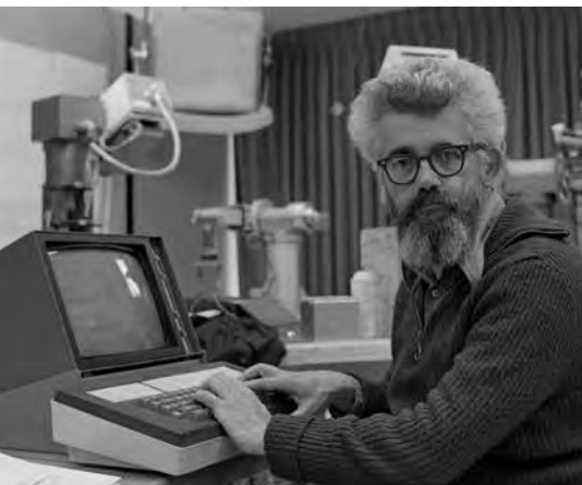
McCarthy in 1974.

My idea was that you wanted description, not just discrimination, and my argument for that was that if you wanted to program a robot to pick up something, then it didn't just have to discriminate on the whole picture. It had to be able to locate the object, and represent its shape, so I decided to try for robotics. " 24