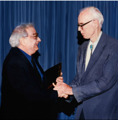
Willis Lamb presents the PQE Lamb medal for laser science to Ali Javan.

Ali had a long and distinguished career at MIT, during which time he received many honors, starting with his appointment as the first Francis Wright Davis Professor of Physics at MIT. He held this position from 1978 through 1996, and thereafter became emeritus professor of physics. Other awards included the Albert Einstein World Medal of Science of the World Cultural Council Foundation, induction into the National Inventors Hall of Fame, appointment as a fellow of the American Academy of Arts and Sciences, and election to the National Academy of Sciences. He was also an honorary associate fellow of the Trieste Foundation for Advancement of Freedom in Sciences and an honorary associate fellow of the Third World Academy of Sciences. If he had a favorite honor, perhaps this latter one was it, as he so often spoke of it when interviewed.