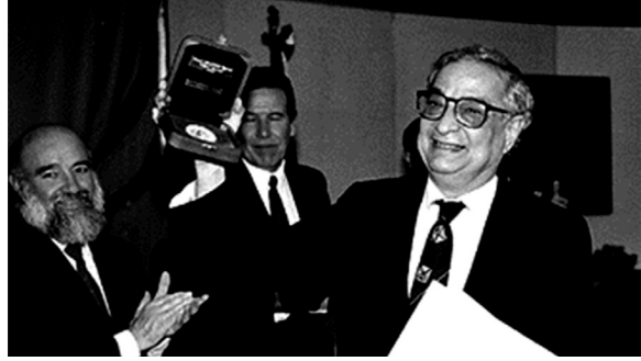
Ali Javan awarded Albert Einstein World medal of Science for his pioneering laser research. (1993)

The benefits of working with Javan were not only scientific. MIT students and his younger MIT associates—including one of the authors—remember him as being inspiring and kind. He valued friendships very deeply, and he treated his students like family.