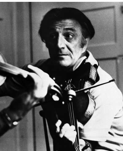
Erwin L. Hahn in the early 1970s.