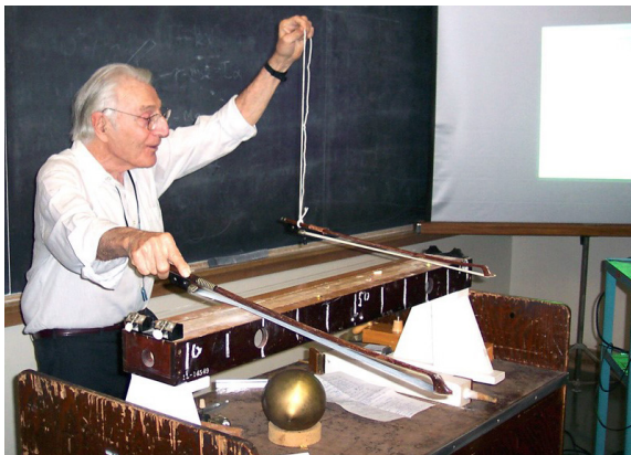
Erwin delivering a lecture on Physics of Music. (March 2004).

At a social event in Asilomar where an NMR conference was running in parallel with a congress of Christian Scientists, Erwin was approached with a question: "Professor Hahn, are you a Christian Scientist?" "No, ma'am" was the answer, "I am a Jewish scientist."