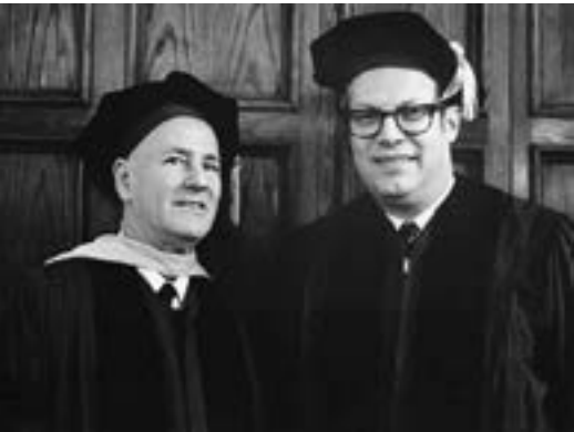
Figure 2. Paul with George Beadle. Photo taken in 1964 on the occasion of being awarded an honorary degree from the University of Chicago.

Although some work on synthetic high polymers initially continued at Harvard, an immediate start was made on the physical characterization of DNA, focusing on molecular weight and characteristic dimensions in solution. The material for these early studies was purified from animal sources by a lengthy (and mechanically brutal) procedure. Different preparations had molecular weights not exceeding \sim 6\text{-}7 million; light scattering and, in subsequent measurements, hydrodynamic properties indicated a very stiff, coiling molecule. A sample with somewhat lower molecular weight led to the prophetic suggestion that long DNA molecules might be sensitive to mechanical breakage (Doty and Bunce, 1952) (5). Denaturation at elevated temperature was shown to involve a co-operative collapse to a more compact conformation (Rice and Doty, 1957).