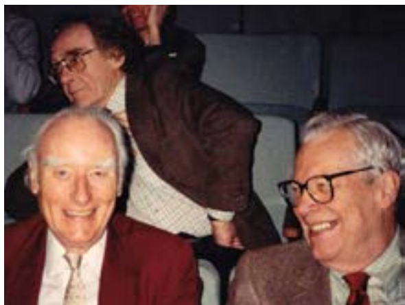
Figure 3. Paul with Francis Crick and (sitting behind them) John Maddox. Photo taken in 1993 at Cold Spring Harbor Laboratory.

The work with the synthetic polypeptides and helix-coil transitions had drawn wide attention, talented students and a succession of prominent visitors to the Doty labo-