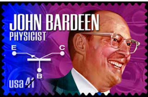
Commemorative stamp issued in 2008.