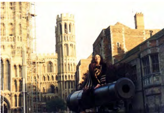
Astride a cannon at Ely Cathedral during her time in Cambridge.