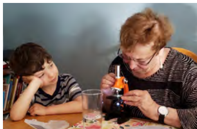
With her great nephew.